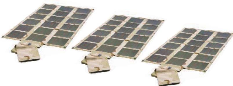
62 Watt + 62 Watt + 62 Watt